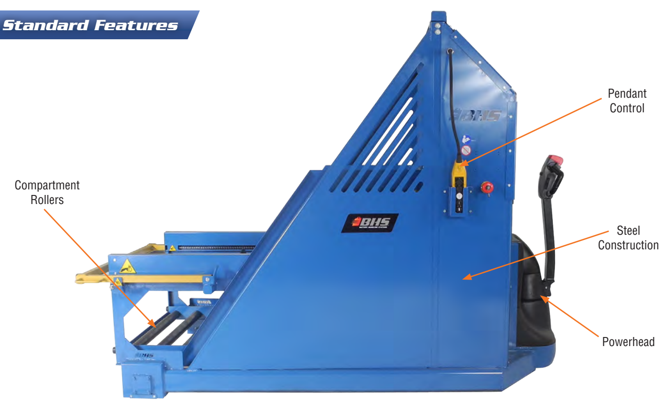
MBE side view